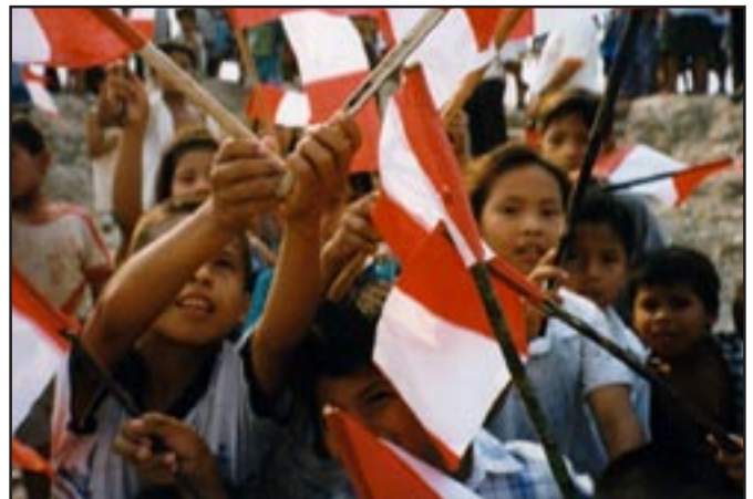
Children of Padre Cocha Welcoming ILZRO RAPS Peru Team

In the Loreto region of Peru where it is the intention to eventually install the hybrid RAPS systems, there are nearly 3,000 communities without access to electricity. Approximately 130 of these communities have records of small diesel gensets that provide electricity for limited periods of time. There are 147 of these diesel gensets in current use ranging up to 500 kilowatts rating. Based on preliminary analyses of CO 2 emissions, a savings of more than 100,000 kg/day of CO 2 is estimated if the hybrid RAPS systems were used instead of the prime diesel option at 24 hours. When these 24-hour figures are extrapolated to the 20 year design life of the RAPS systems, the savings in CO 2 emissions would be nearly of 1,000,000 metric tons. Savings in additional pollutant emissions are also estimated: Nitrous Oxides 21,072,106 kg; Total Suspended Particulates 806,260 kg; Hydrocarbons 1,795,710 kg; Sulfur Dioxides 1,044,443 kg; Carbon Monoxide 29,757,479 kg. There would be significant savings in the emissions of greenhouse gases and other noxious pollutants if hybrid RAPS systems were to be successfully installed operated and replicated in rural areas of Peru